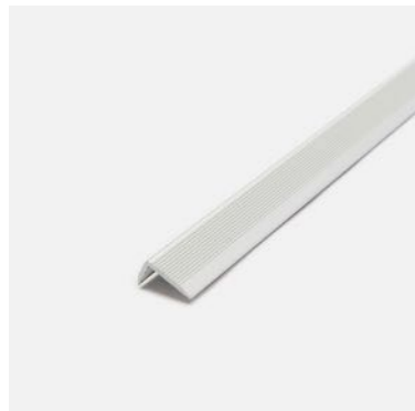
MULTI ANGLE 3400 x 19 x 7mm