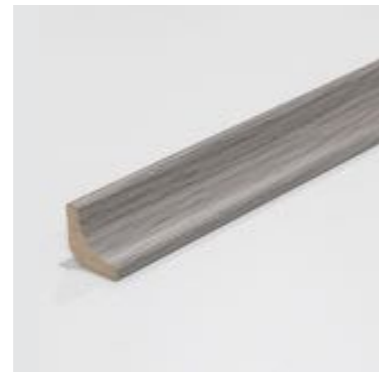
SCOTIA 2400 x 19 x 19mm

All flooring accessories available in vinyl wrap colour range depicted.