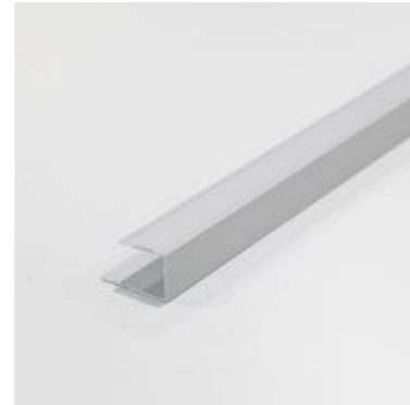
MID END 3400 x 19 x 12mm