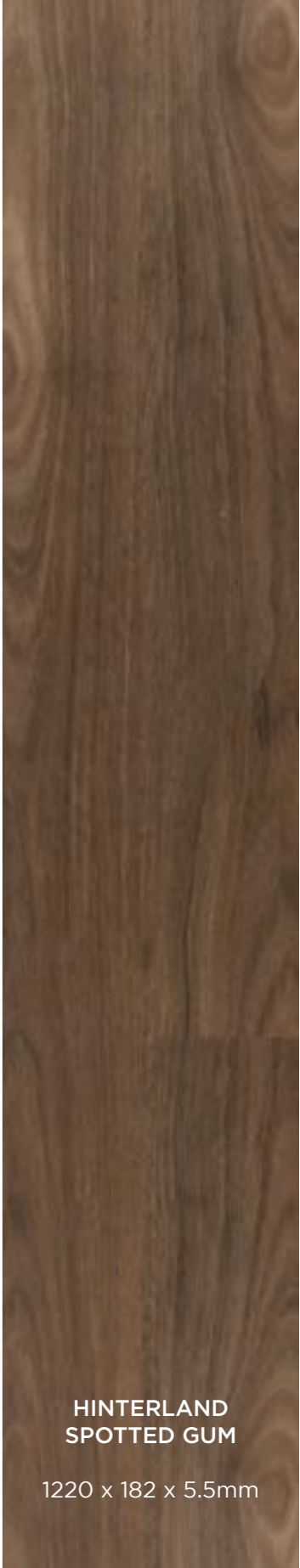
HINTERLAND SPOTTED GUM