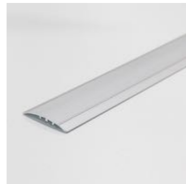
COVER TOP 3400 x 45mm