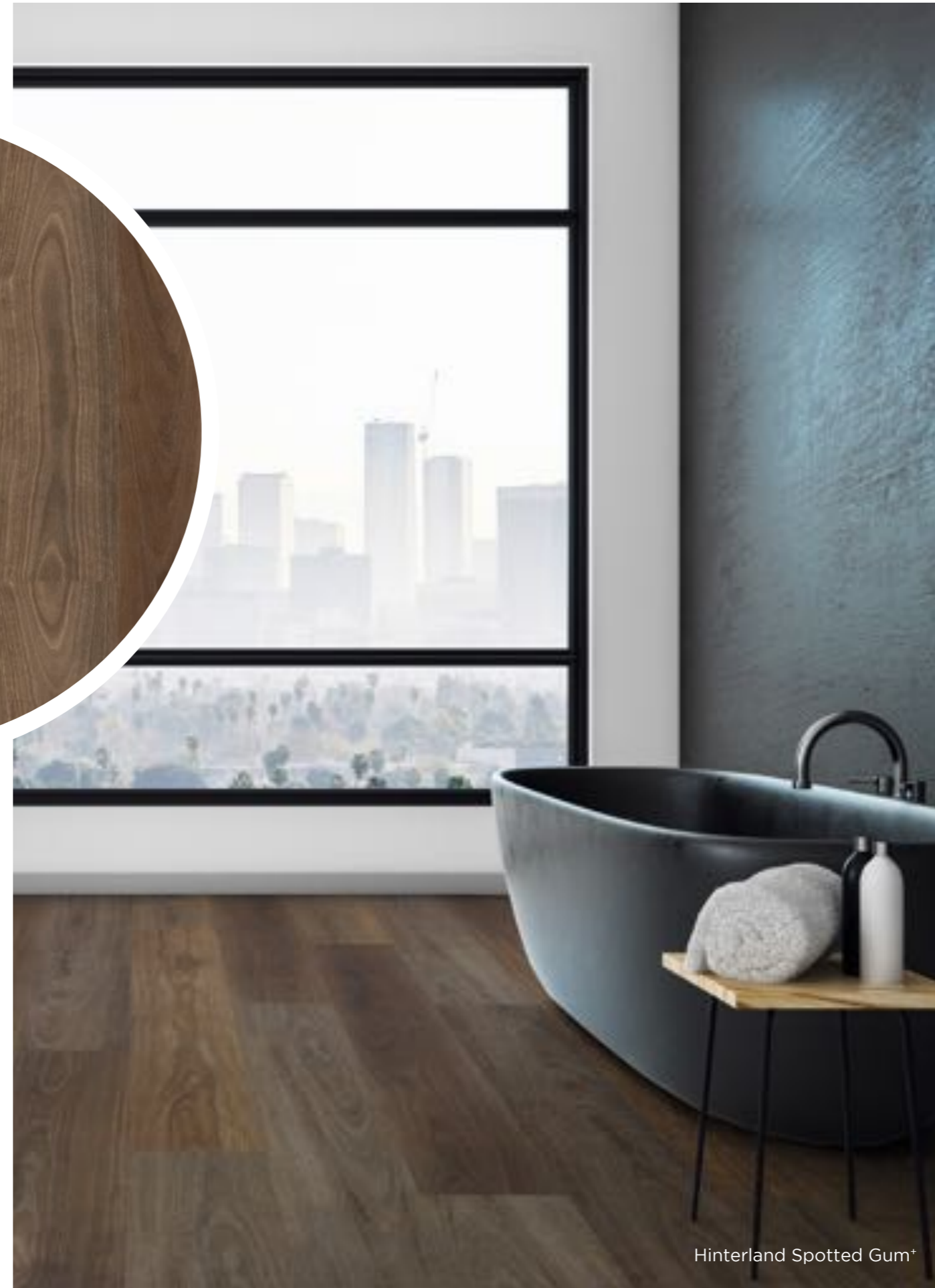
Hinterland Spotted Gum*

Supplied with a pre-installed noise reduction underlay, Atlantis planks are easy to handle during installation. The tried and tested drop lock profile is quick and easy to install with no messy glues required, allowing you to walk on your floor the same day it is laid.