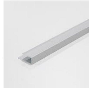
JUNIOR END 3400 x 19 x 8mm