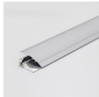
UNIVERSAL 3400 x 45mm