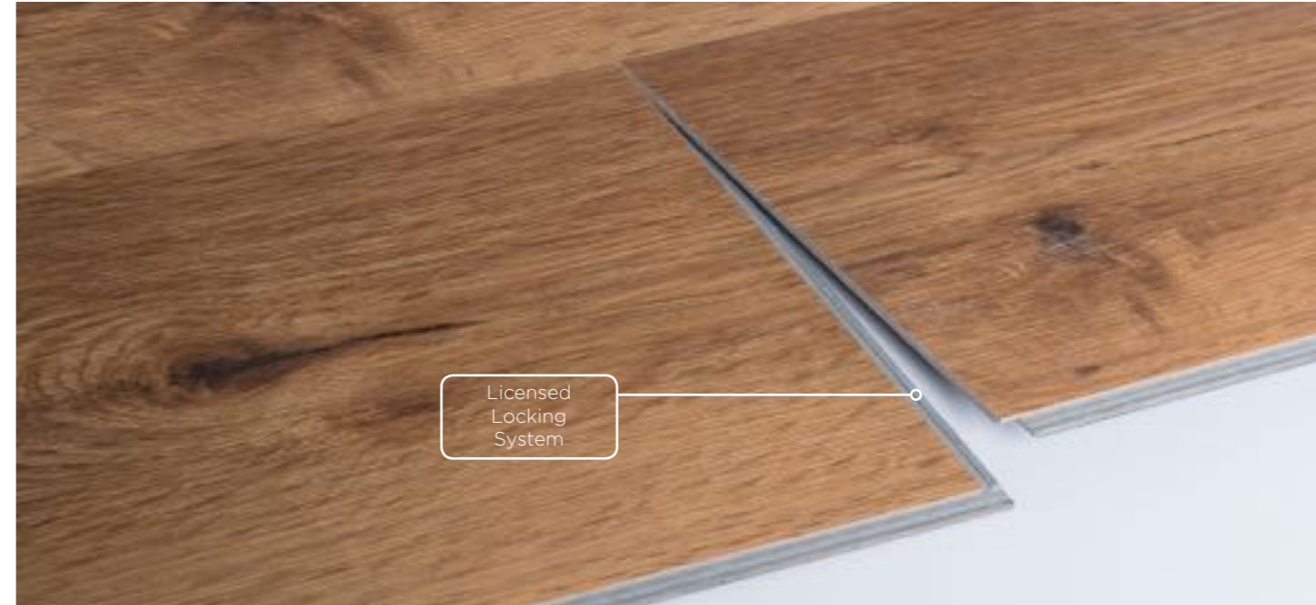
Licensed Locking System